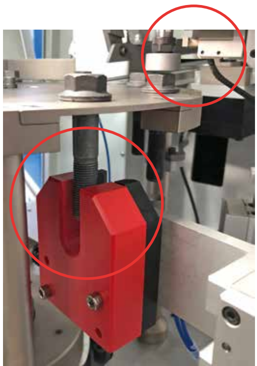
Fig. 1 – ibg fork coil for microstructure testing and ibg crack test probe at work

In addition to the manufacturing and machining of fasteners the effective and efficient heat treatment testing and sorting is critical to improve on the challenges above. Key testing parameter for heat treatment is the structural homogeneity of the desired microstructure. The homogeneity may vary due to the complex nature of the processing and heat treatment steps. It therefore requires accurate, cost-effective and high-speed 100% NDT testing to detect potential issues of parts as shown in Fig. 2 below.