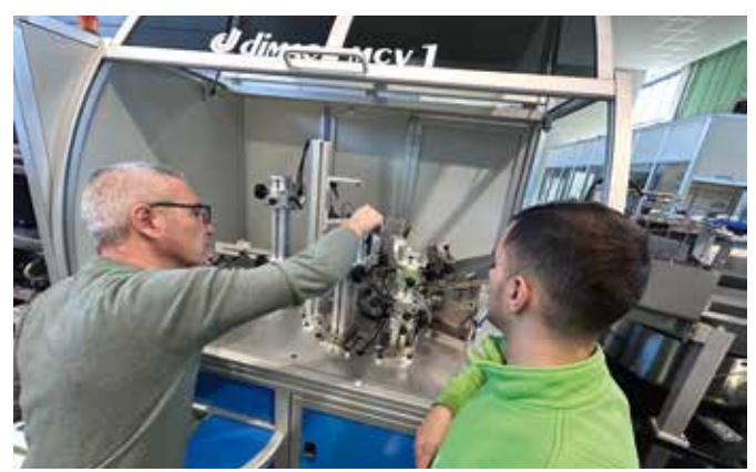
Ibg & DIMAC experts teaming up

The advanced and easy-to-use NDT structure testing instrumentation by ibg is able to learn what a correct